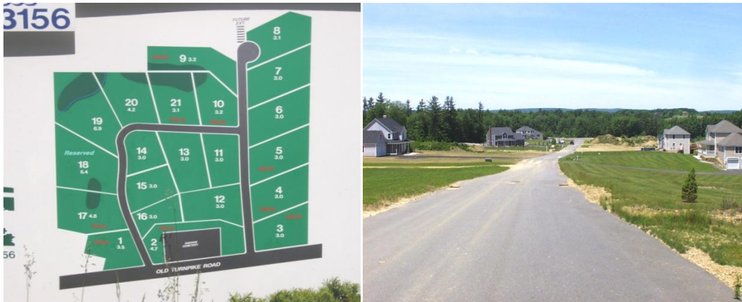
Three acre conventional zoning on the ground in Oakham, MA

In suburban and urban regions, these lot requirements are out of character with older settlements and squander available public sewer and water service opportunities. What open land remains in these communities is more rapidly consumed in one to two acre bites. In such places, these minimum lot sizes are far too large and often are exclusionary. In rural towns, minimum lot size requirements of two or three acres and greater chew up the countryside at a more rapid rate, fragment wildlife habitat, and create parcels too small to support farming or forestry.