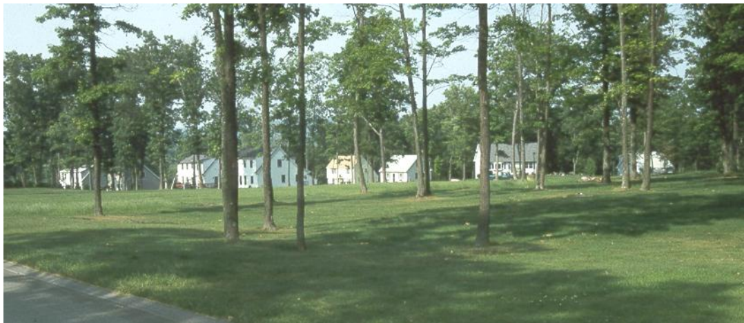
Common open space in a cluster subdivision in Belchertown, MA

When cluster development options or requirements are introduced and based upon the underlying conventional zoning, the results have proven unsatisfactory. While a more aesthetically pleasing way to subdivide land that affords marginally better protection for wetlands, the remainder lands preserved by most cluster development are inadequate to fulfill their resource protection purposes, whether to sustain farming or forestry or protect habitats, scenic views, or water supplies. Reliance on the underlying zoning for purposes of determining allowable lot counts often yields too many housing units, an insufficient amount of protected open land, and layouts that destroy the natural resource and environmental value of the remaining land.