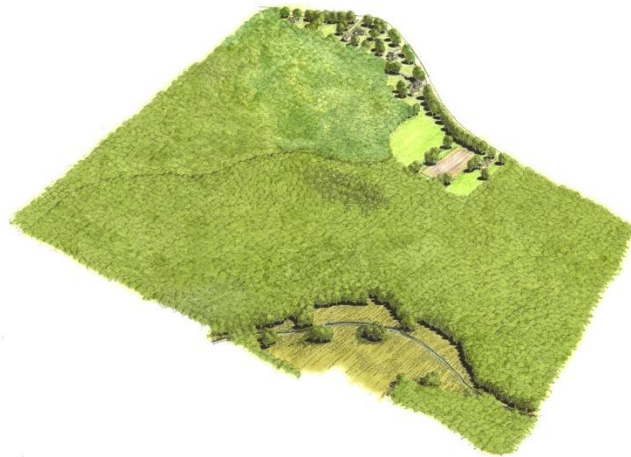
100 acre wooded site with field, stream, and trail before development