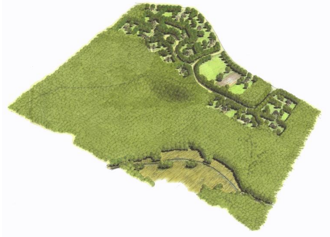
Natural Resource Protection Zoning (14 lots, >75% preservation)