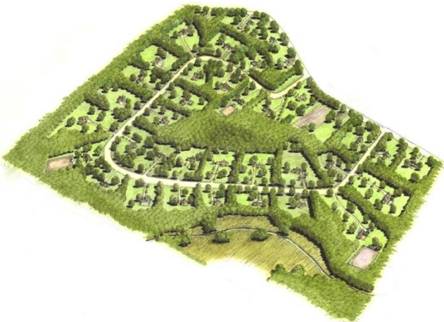
Two-acre zoning/conventional subdivision (34 lots, no preservation)